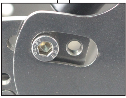
13a Locate the adjusting device as shown above.

The stabiliser arms can be adjusted to 3 different angles, to suit the shape of the pipe being inspected. Each arm can be adjusted independently.