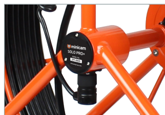
Integrated Meterage Counter