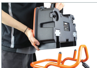
Easy-fit Control Unit