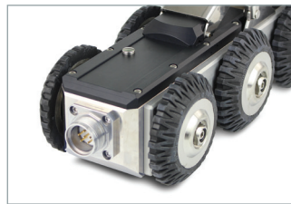
Heavy Duty Rear Connector