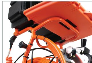
Easy Fit Control Unit