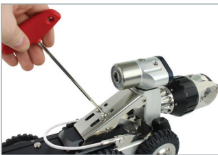
Quick Release Lift